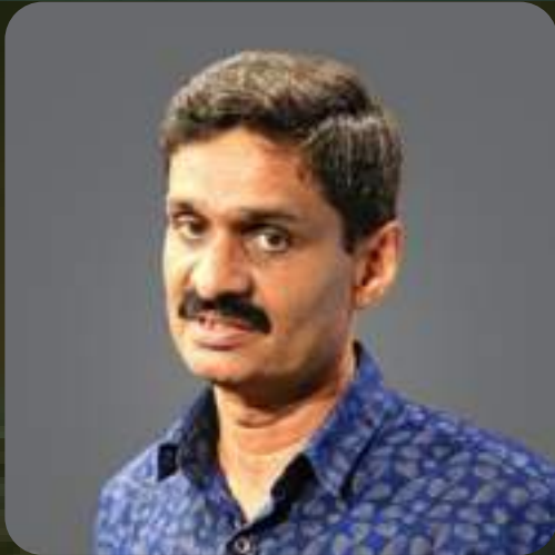
Founder & Symposium Chair