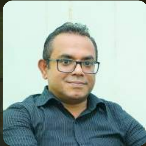
Head of the Department