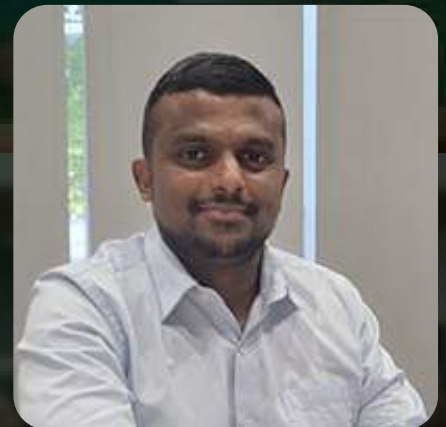
Symposium Co- ordinator