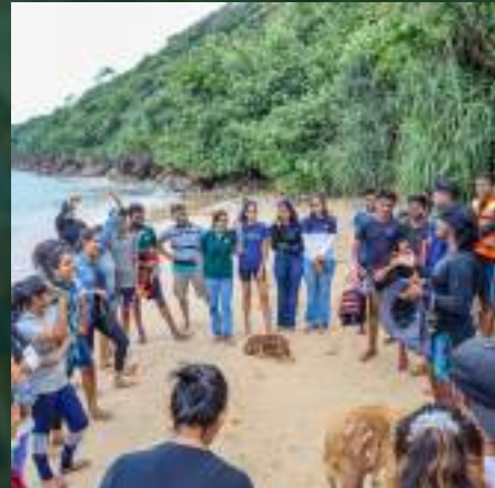
Thematic Sessions & Workshops