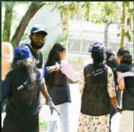
Technical Field Visits