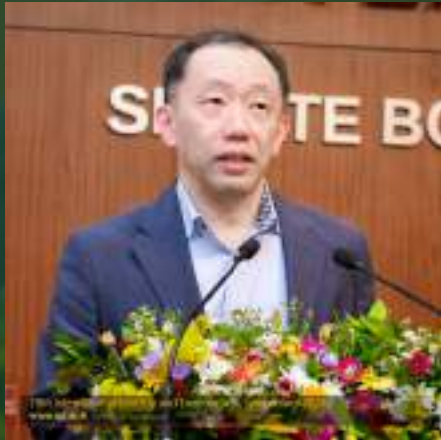
Distinguished Keynote Speakers