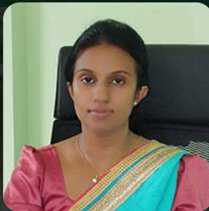
Symposium Co- ordinator

+94 74 251 1557 sandalidissanayake@sjp.ac.lk